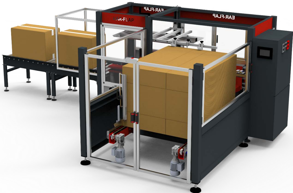
Photo: Automatic case former model BEM300 outfeed left with motorized horizontal cases magazine + Motorized rollers conveyor