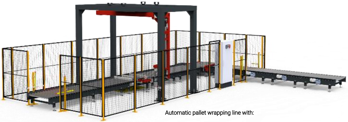
Automatic pallet wrapping line with:

Examples of automatic pallet wrapping lines with the model ARM3500